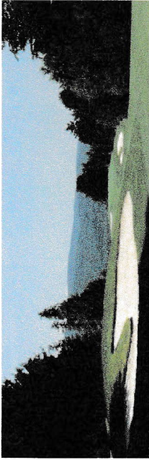
COUNTRY CLUB of HARRISBURG