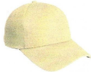
Port Authority® - Easy Care Cap. C608

The ultimate uniforming cap featuring all the easy care qualities you love about our Easy Care Shirts (S608) and Silk Touch™ Sport Shirts (K500). This cap coordinates with the shirts, and is available in the top 11 uniforming colors.