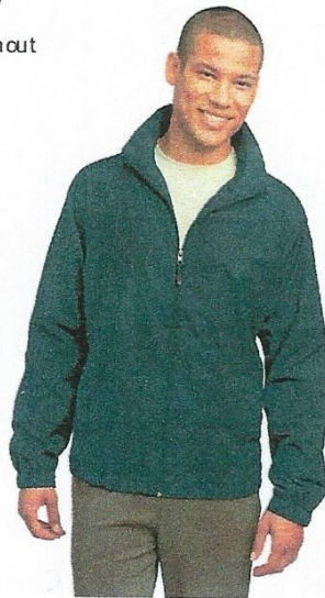
Sport-Tek® - Full-Zip Wind Jacket. JST70

Shirts & Jackets XXL 47 - 49 3XL 50 - 53 4XL 54 - 57 5XL 56 - 60 6XL 61 - 63